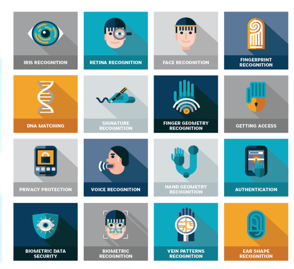
Fig.1 the various types of Biometric authentication II. LITERATURE SURVEY

Fingerprint Recognition, DNA Matching, Signature Recognition, etc.